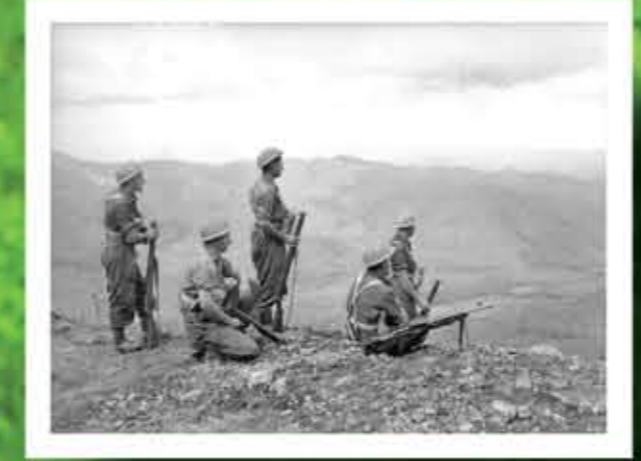
Australian War Memorial - Image No 027631