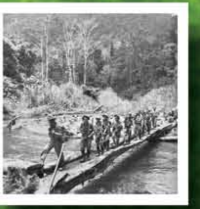
Australian War Memorial - Image No 027600