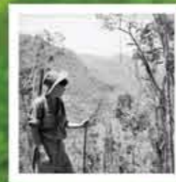
Image No 026170