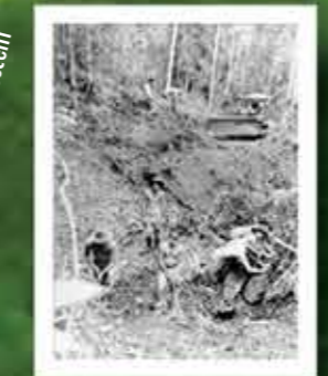
Australian War Memorial - Image No 026370