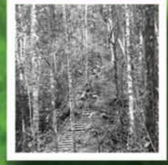
Image No 026021