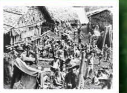
Australian War Memorial - Image No 027636